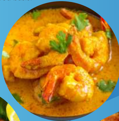
Royyala Pulusu (Prawns Curry)