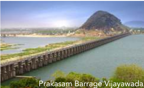
Prakasam Barrage Vijayawada