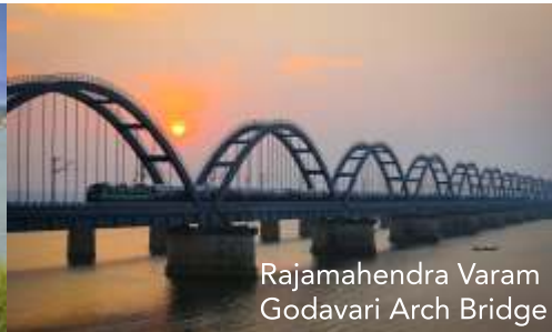
Rajamahendra Varam Godavari Arch Bridge