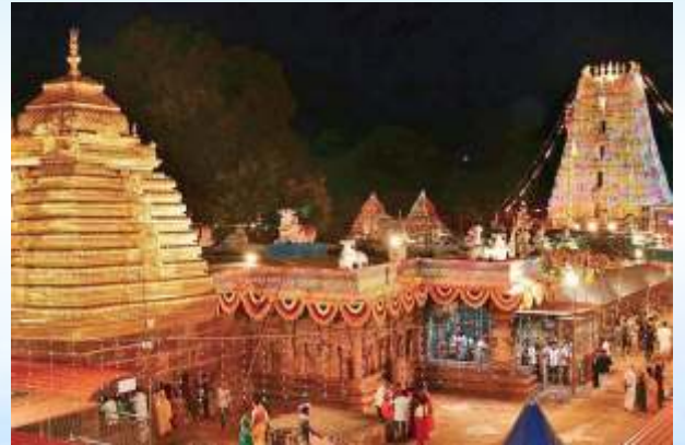
Sri Mallikarjuna Swamy Temple, Srisailem