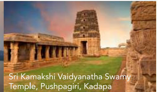
Sri Kamakshi Vaidyanatha Swamy Temple, Pushpagiri, Kadapa