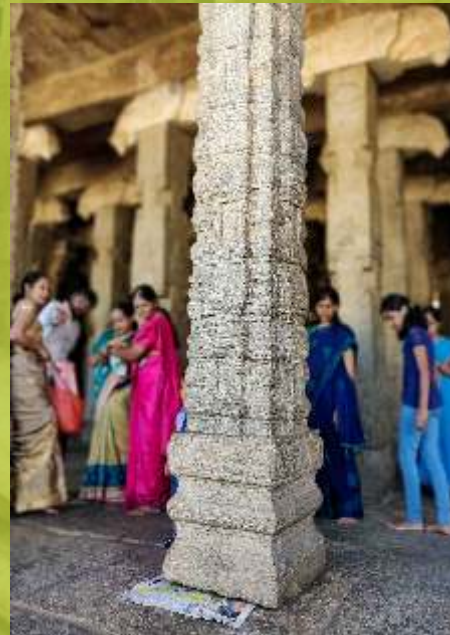
Hanging Pillar, Lepakshi