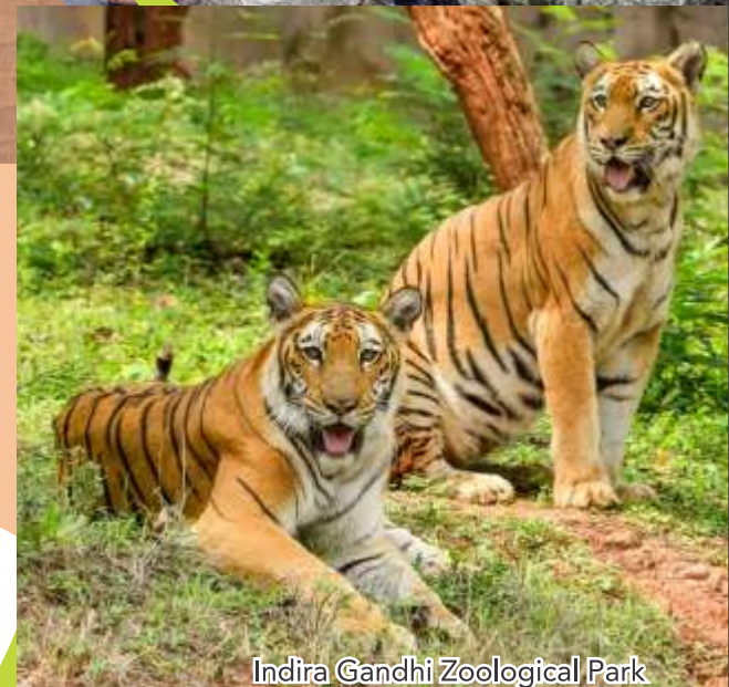
Indira Gandhi Zoological Park