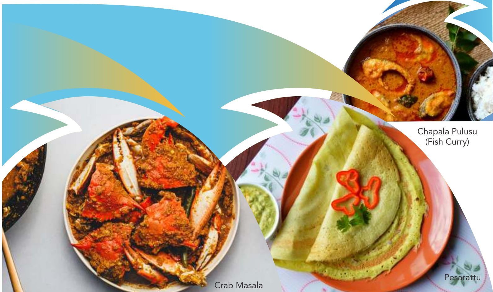
Chapala Pulusu (Fish Curry)